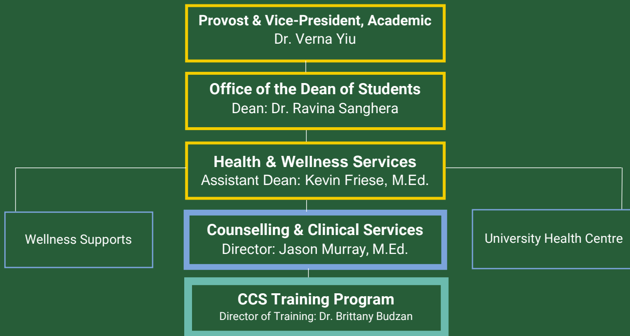
Figure 1. Organizational Structure of Counselling & Clinical Services

CCS is a branch of the Office of the Dean of Students within the University of Alberta. CCS is a multidisciplinary professional agency staffed by 15 registered psychologists, three social workers, two to six psychologists-in-training who are supervised by senior staff, eight part-time psychiatrists, two mental health consultants (MHCs), and four administrative support staff. Our services are available to all students who pay student services fees, and individual counselling sessions are available at no additional cost to the student. Students are seen primarily for individual and group counselling; we also provide couples counseling, workshops for students or staff, consultation and, less frequently, vocational testing. Presently CCS serves a student body of approximately 40,100 students from 156 countries.