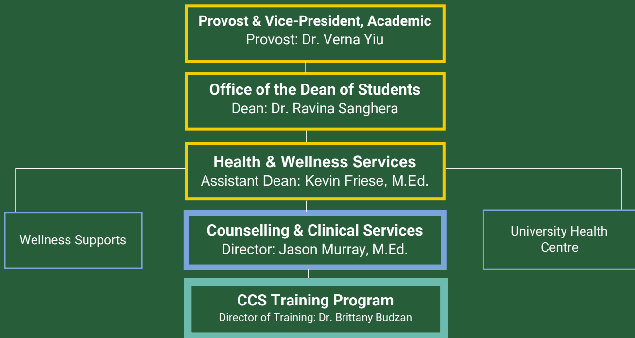
Figure 1. Organizational Structure of Counselling & Clinical Services

CCS is a branch of the Office of the Dean of Students within the University of Alberta. CCS is a multidisciplinary professional agency staffed by 15 registered psychologists, three social workers, three to six psychologists-in-training who are supervised by senior staff, eight part-time psychiatrists, two mental health consultants (MHCs), and four administrative support staff. Our services are available to all students who pay student services fees, and individual counselling sessions are available at no additional cost to the student. Students are seen primarily for individual and group counselling; we also provide couples counseling, workshops for students or staff, consultation and, less frequently, vocational testing. Presently CCS serves a student body of approximately 40,100 students from 156 countries.